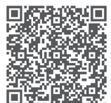
Capital Gains Tax in Relation to Property

Contact The Big Small Firm to complete this journey.